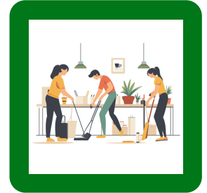
Maintaining a clean environment