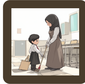
You and other students help your teacher by sweeping the classroom tidy.