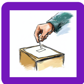
You vote in a presidential election once you turn 18