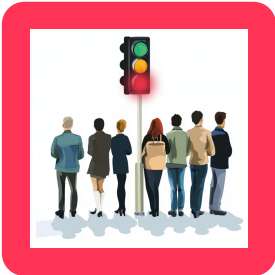
You wait for the traffic light to turn green before crossing.