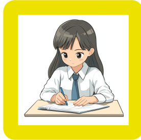
Completing School Assignments.