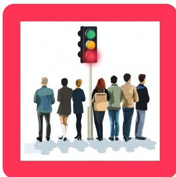
You wait for the traffic light to turn green before crossing.