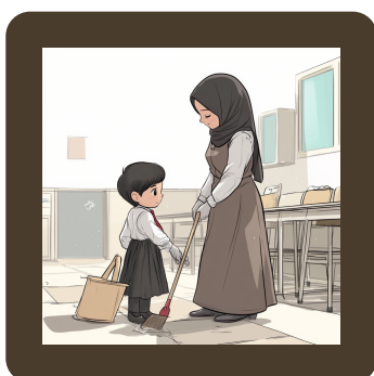
You and other students help your teacher by sweeping the classroom tidy.