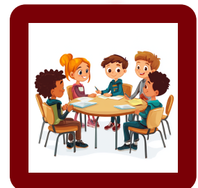
You participate in a classroom discussion.