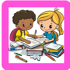
Assisting your peers with work they need help with.