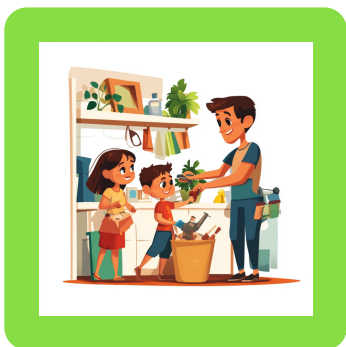
You help your family with household chores.

Cut out the scenarios and categorize them into 'RIGHTS' and 'RESPONSIBILITIES'.