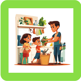
You help your family with household chores.