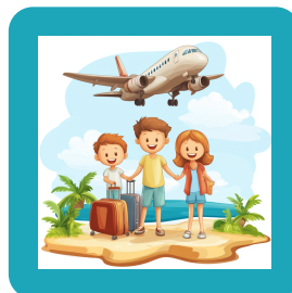
Your family decides to move to a new island.