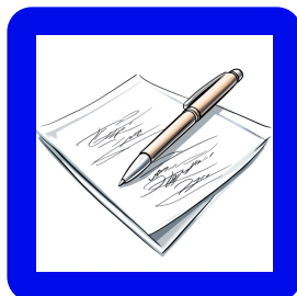
Your peers sign a letter that expresses your opinion about wanting a longer interval period to the principal.